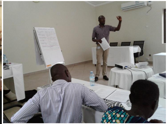
A trainer guiding a discussion on a subject matter