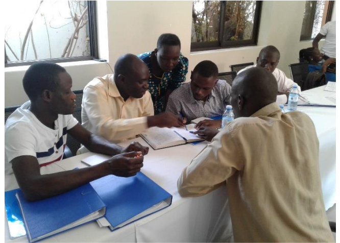
Group discussions on course activity-Timisha hotel