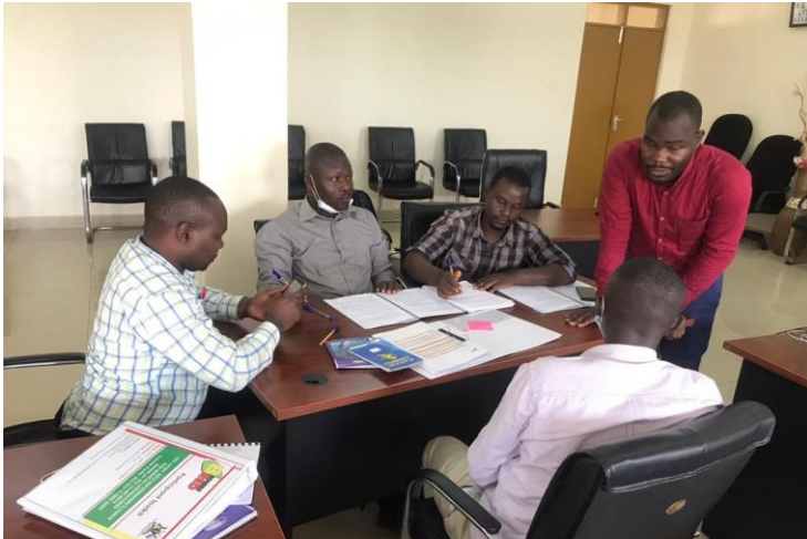
A trainer supporting a group discussion