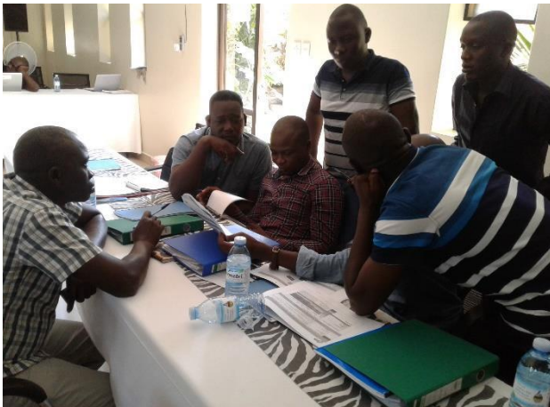
Group discussions on course activity-Timisha Hotel