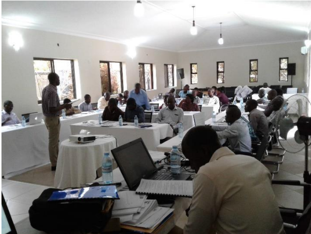
One of the participants explaining a concept to others after grasping it well from the trainer-Timisha hotel.