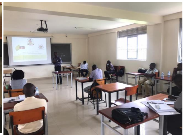
Lab manager giving remarks at Muni University