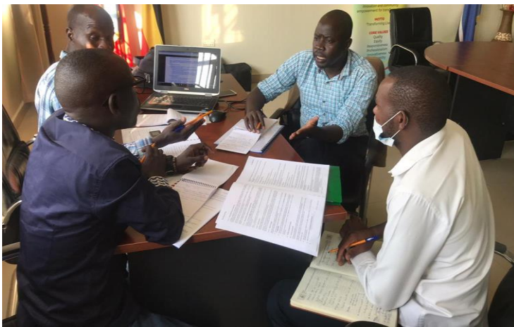
Group discussion in a Biosafety training at MUNI university