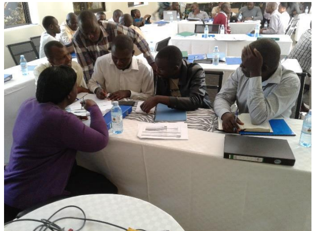
Group discussions on course activity-Timisha hotel